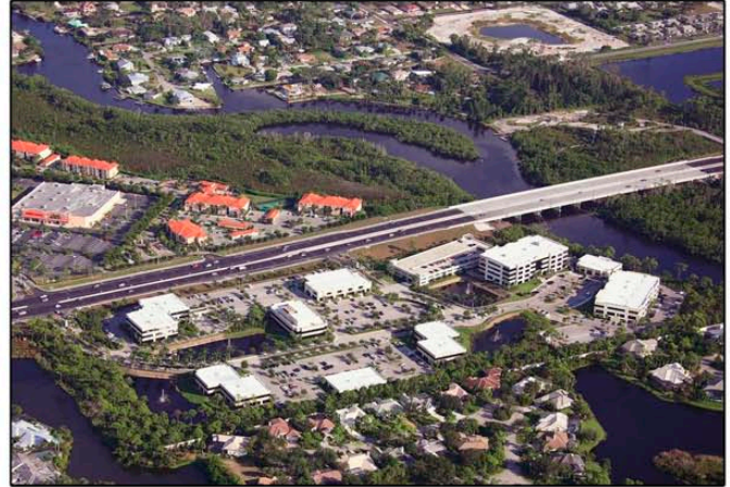
Riverview Corporate Center